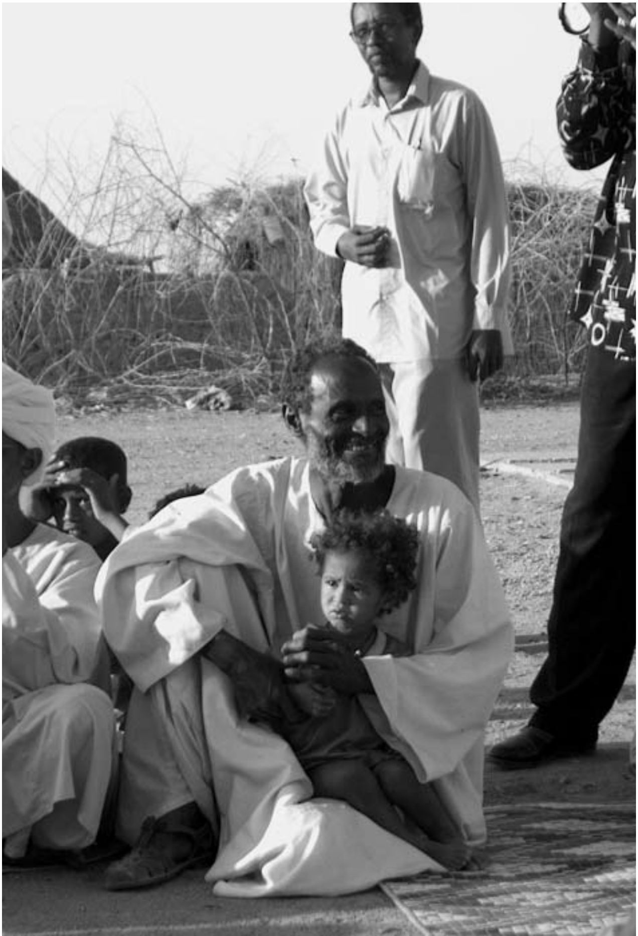
A man from the Beni amir ethnic group for eastern Sudan holds his daughter while attending a workshop on FGM, Idimair, Kassala State.