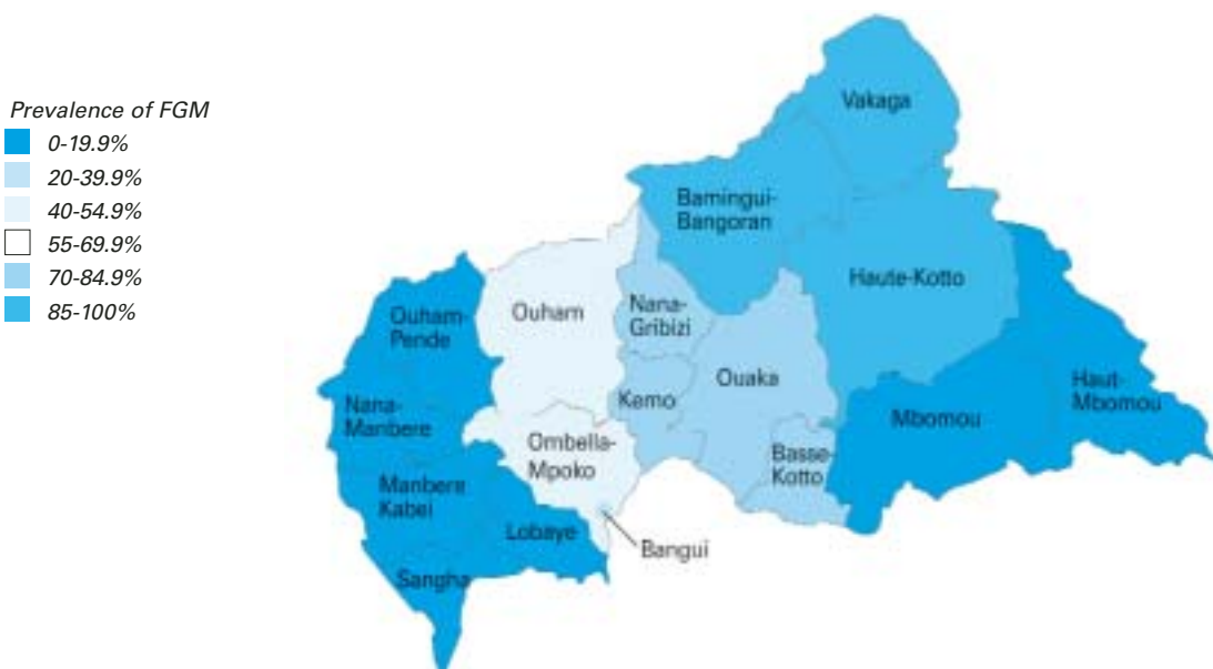
Map 2 - Central African Republic, 2000

The value of disaggregation by region or province is illustrated by the case of the Central African Republic (map 2), where data from MICS2 indicate that, at the national level, 36 per cent of women aged 15 to 49 have undergone FGM/C. Looking at the situation from a sub-national perspective reveals significant geographic variations. In five prefectures in the west of the country and two in the east, FGM/C prevalence